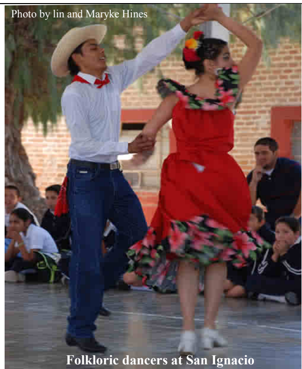
Folkloric dancers at San Ignacio

Travel safe -- enjoy the memories, and we look forward to meeting you again along the way. Hugs