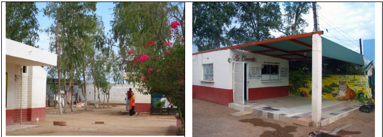
More photos from around Benjamin Hill