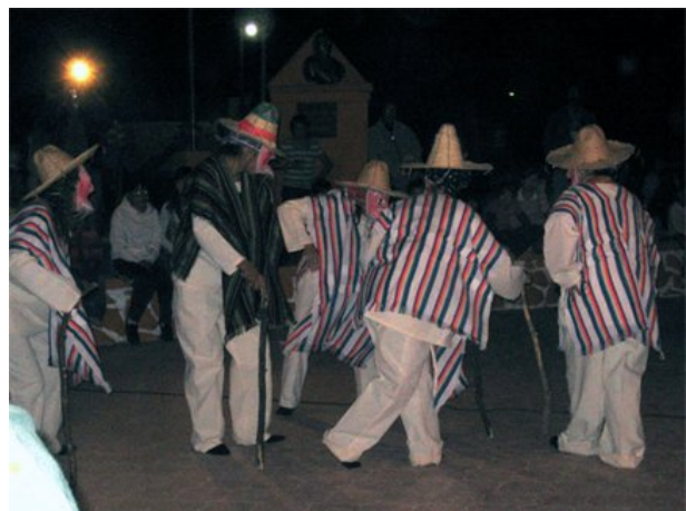
Photos above show some of the fiesta performers.